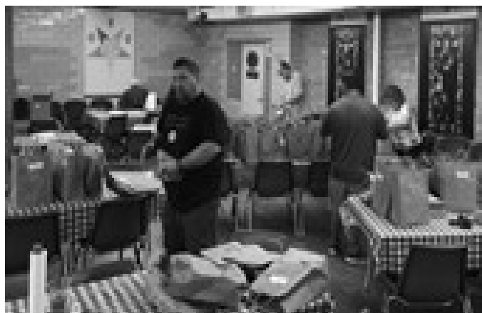
Building out the kits