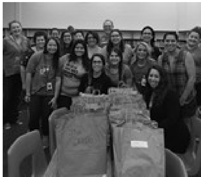
School supplies delivered